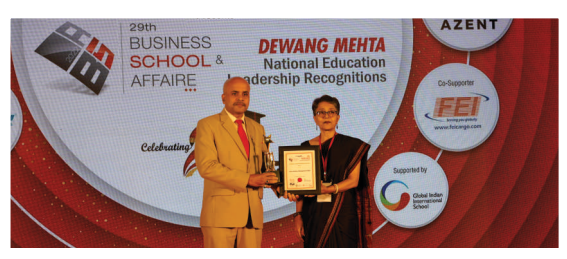
Academic Leader in Business Analytics