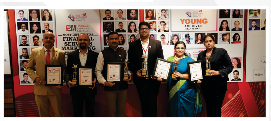
National Education Awards-2022