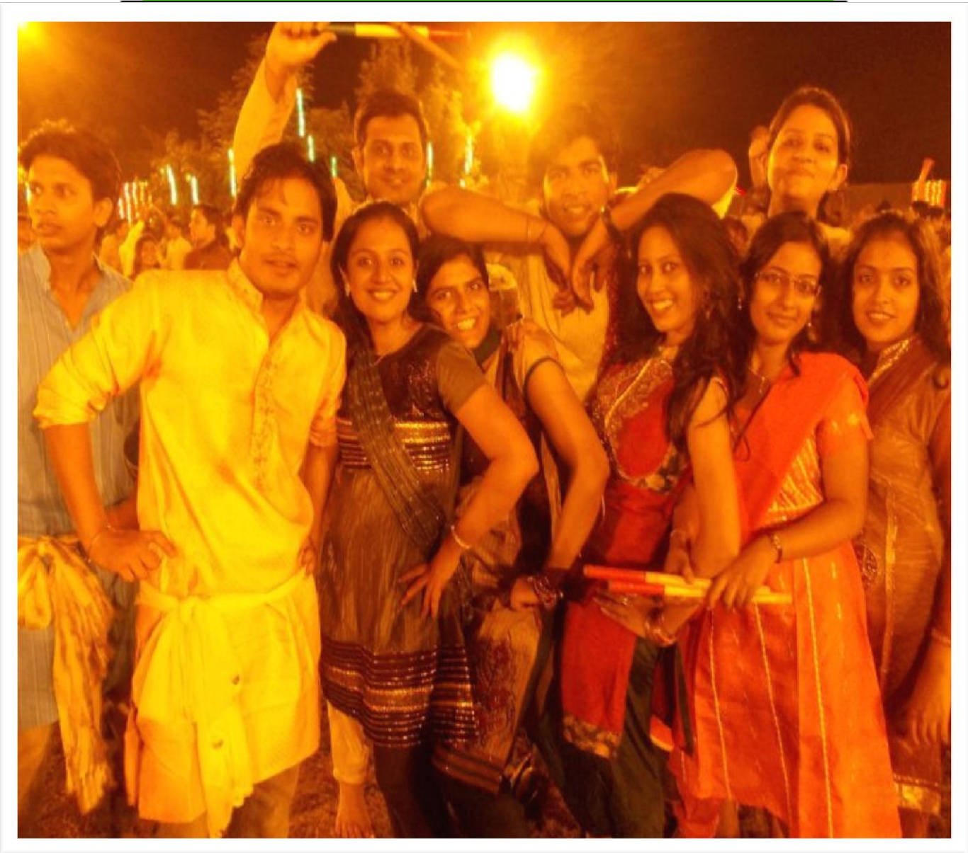
DDV: 30<sup>th</sup> Sep 2011 – INS Campus