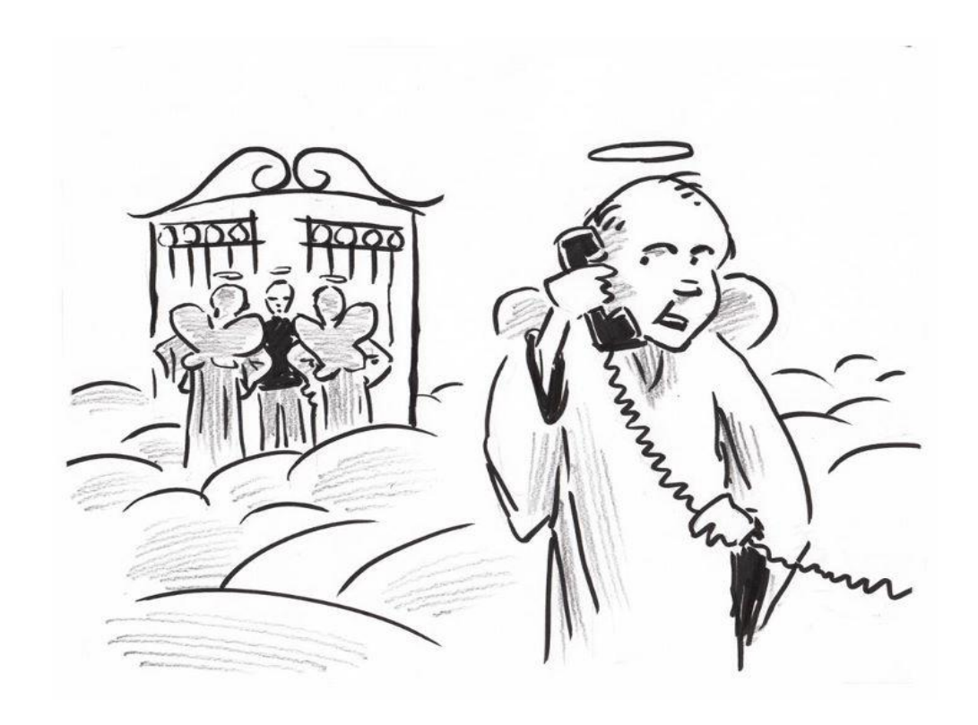
"We've got a troublemaker here, Sir. He arrived with his own halo, he insists on wearing a black turtleneck, and I don't like the way he's looking at my phone."