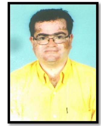
By: Prof. Sachin Napate ISBS, Pune

The market size of the popularly known miracle bean in India is over Rs.5000 crores. With an annual production of 5.0-5.4 million tons, soybean constitutes nearly 25% of the country's total oilseed production. The avg. monthly fluctuation in prices of soybean traded at one of the active soybean spot market at Indore has been at 10.07% during the past two yrs., the max. Monthly fluctuation being as high as 24-30% during the period. Historically, soybean prices in the major spot markets across the country have been fluctuating in the range of 5-9%. Soybean is the single largest oilseed produced in the world. The commodity has been commercially exploited for its utility as edible oil and animal feed. On crushing mature beans, around 18% oil could be obtained; the test being the oil cake/ meal, which forms the prime source of protein in animal feeds.